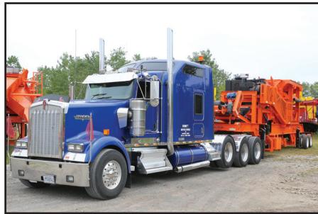
Easy, one-pull transport. Check with your DOT.